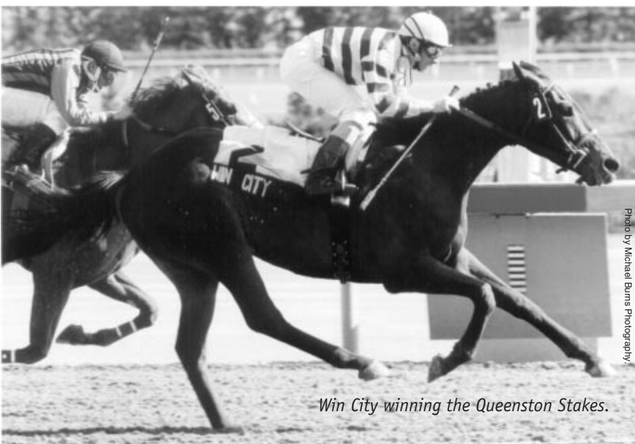
Win City winning the Queenston Stakes.