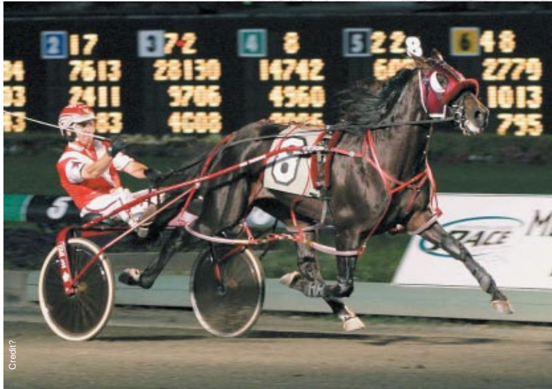
Allamerican Theory (left) and Amigo Hall (below) are fed feeds formulated by Kentucky Equine Research and manufactured by Brooks Performance Horse Feeds.

Kentucky Equine Research proudly congratulates Brooks Performance Horse Feeds for supplying the feed to Amigo Hall, winner of the $1 million Hambletonian, and Allamerican Theory, winner of the $1 million Meadowlands Pace.