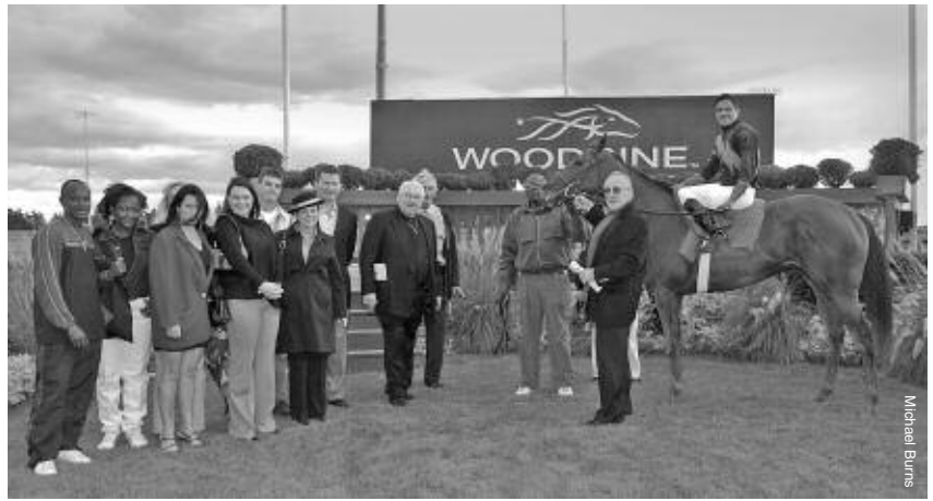
Colebrook Farms' homebred Foxy Money claimed victory in the Bull Page Stakes at Woodbine Raceway in Rexdale, Ontario last October. Finishing in second place in the same race was another graduate of the Colebrook program, Trail Fox. This one-two finish speaks volumes for the farm's aptitude for breeding, raising, training, and racing winners.