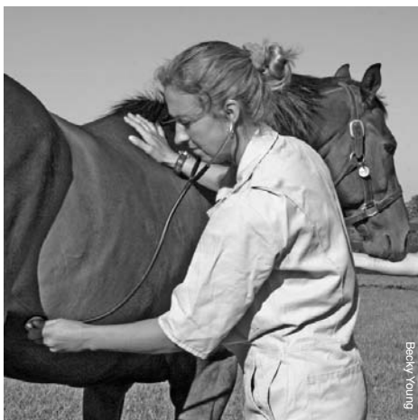
The KERx Special Needs Nutrition program centers on proper nutrition as a factor in the wellness of all horses. Veterinarians are key components of the program.

Would your veterinarian be interested in learning more about the KERx program? Show your veterinarian this article, and have him or her contact KER today at 1-888-873-1988! It's never too late to be concerned about your horse's wellness.